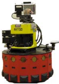
Figure: artoo.bu.edu is configured with IR beam detectors and a gimbaled mirror system for research on freespace optical communications. Artoo is one of several mobile robots dedicated to research in the Center for Communicating Networked Control Systems.

A related component of the research at Boston University is aimed at exploring ad hoc freespace optical networks technologies. Some of the early work – described in previous interim progress reports, involved the use of mobile robots to establish and maintain line-of-sight communication links between advanced (Canobeam) freespace optical communication transceivers. The main idea was to deploy a squadron of mobile robots with steerable mirrors that could be used to find and redirect laser beams. This system had the advantage over most commercially available systems in which fixed transceivers must be carefully aligned to assure good signal reception. The technology needed to dynamically reconfigure freespace optical communication networks required the solution of several interrelated problems: