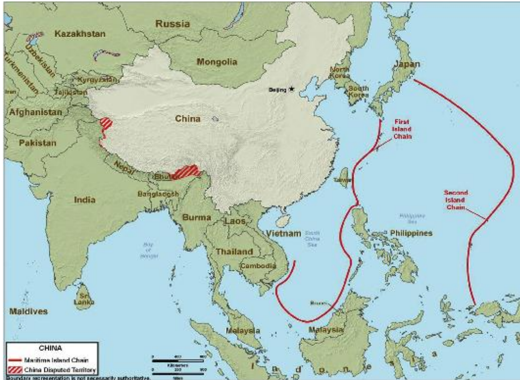
Figure 1. Lines indicate the first (closest to the PRC mainland) and second island chains (the line east of Japan and the Philippines), PRC military theorists conceive of two island “chains” as forming a geographic basis for China’s maritime defensive perimeter, Annual Report to Congress, Military Power of the People’s Republic of China , (Washington, D.C., 2009) 18.) Document is in the public domain.

its operations will change, with the potential for a significant impact on the U.S. Navy. The PLA(N) is already sailing with consistency beyond its traditional operating area within the first island chain. 5