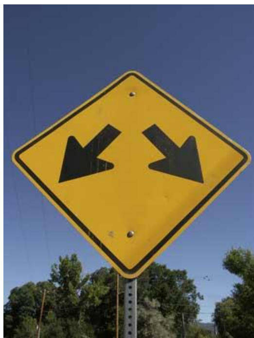
Figure 4: The Real Issues are Non-Legal, as represented by the “fork in the road” sign

Some of the previously discussed laws do present actual legal barriers to collaboration; others are present barriers to collaboration because of the way the law is understood or could be applied.