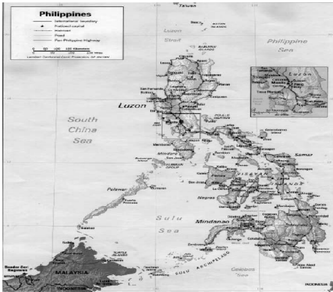
Figure 1. The Philippines