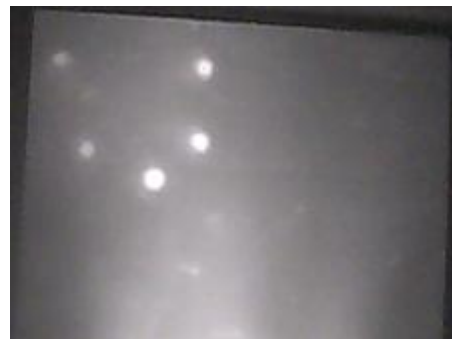
Figure 2: Infrared image of 5 blobs (4 fingers + thumb)

Software based on computer vision techniques maps the blobs' camera coordinates into the projector coordinates taking into account keystone effects and surface, camera, and projector alignment issues. We used affine transformation matrices calculated from a 4-point alignment procedure. The net result is a programming environment that provides touch events for multitouch-enabled applications. Touch events are similar to mouse events in conventional single user applications except with multitouch there are conceptually any number of simultaneous "mice" each of which is associated with a recognized blob. The events COMET recognizes are blob down when a touch begins, blob move when you drag your finger over the surface, and blob up when you stop touching the surface. At any given time there can be any number of active blobs with each blob given a unique identifier.