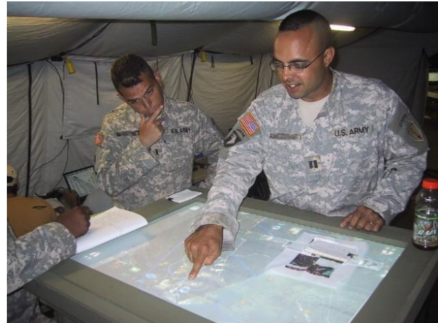
Figure 3: COMET in Use in TOC at Fort Dix

system is that users can directly manipulate the data. They can draw on the map with their fingers, they can "pick up" objects and move them, and they can pan, zoom, and rotate the map with their hands all while collaborating eyeball to eyeball across the work surface.