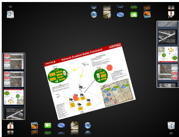
Figure 4: Typical COMET Desktop Display

Although not a full-fledged C2 application, Slick-Demo’s collection of features gave users a sense of how