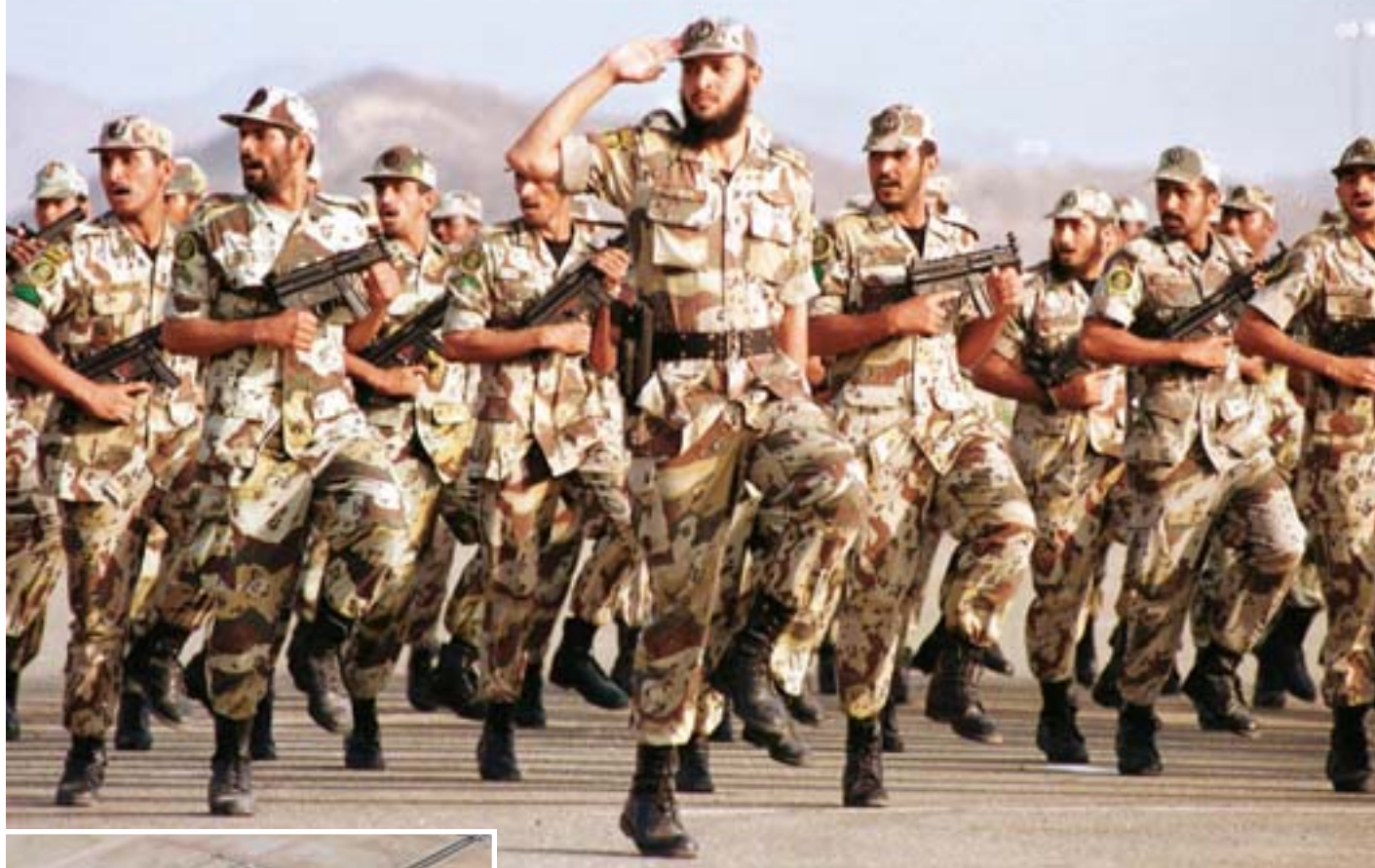
Saudi soldiers passing in review.