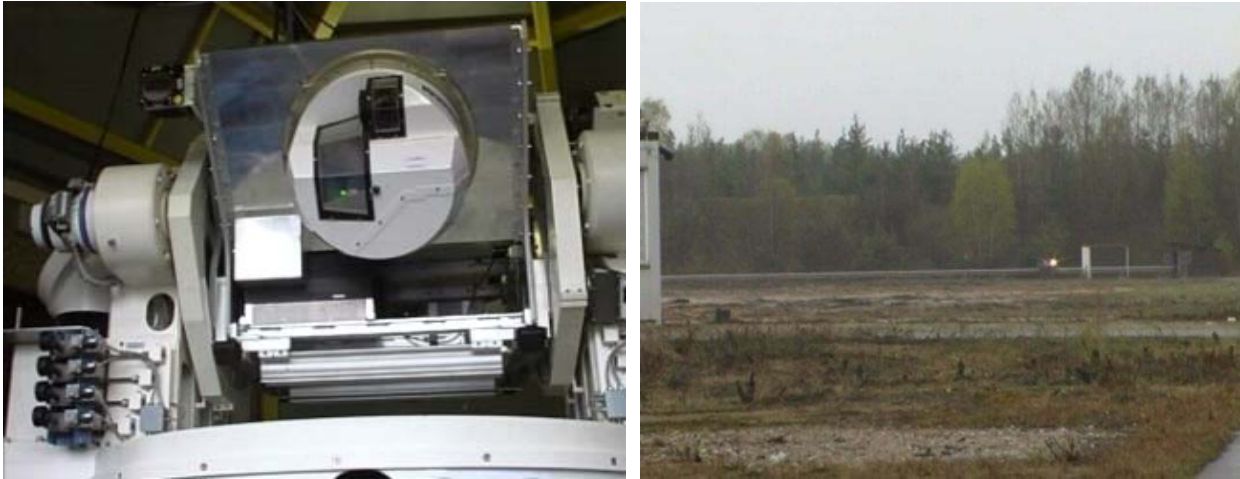
Figure 3 Moving Platform (left), Moving Target (right)

The ground tests comprise of the following tests: