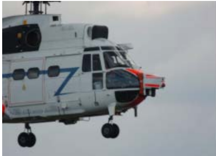
Figure 8 Seeker head mounted on helicopter

In contrast to the ground tests performed in the project, the helicopter approaching the FLASH system and carrying the seeker head was able to simulate an approaching missile. The ability of passive and especially active tracking as well as jamming could be proven under dynamic conditions. The signal of the missile simulation sources is weaker at greater distances and becomes stronger as the helicopter approaches. Therefore the ability of the system to cope with strong signal intensity variation was tested and proven during a number of flights.