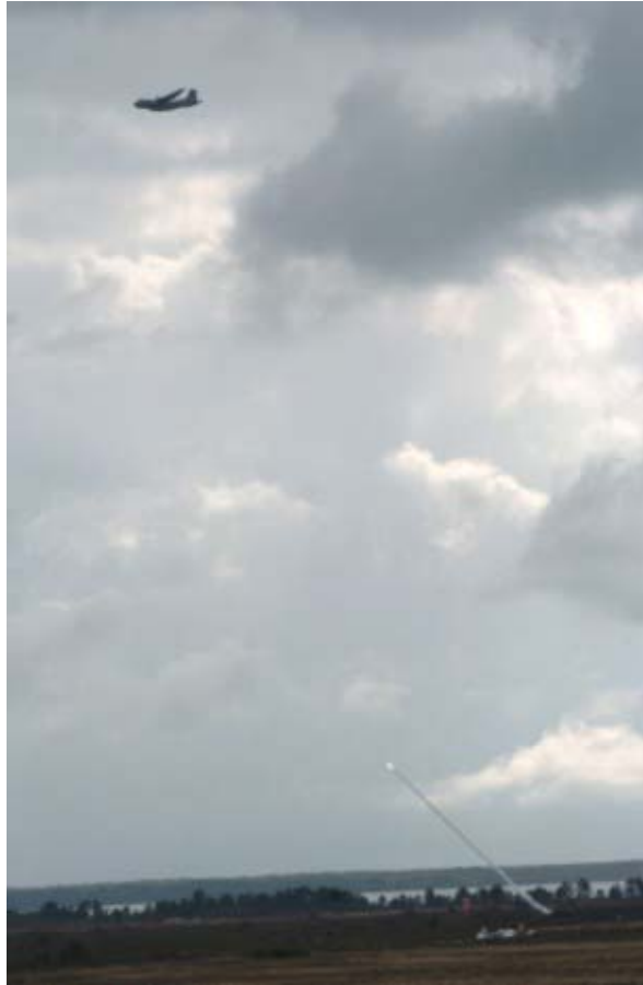
Figure 7 SIDEMIR firing at C160