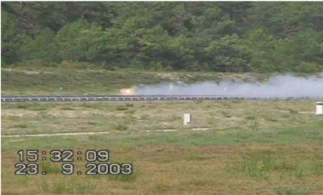
Figure 4 Sledge Missile Firing

In addition a series of missile sledge firing tests at the test range of CEL (Biscarosse, France) to validate the passive tracking part of FLASH for different missiles' propulsions (Figure 4 ).