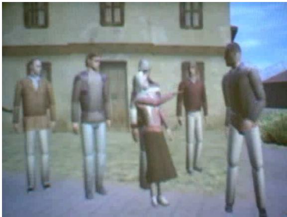
Figure 2: Bosnian Group in conversation

types of gestures to indicate speaking and other motions. Figure 2 shows a snapshot of the characters involved in conversation.