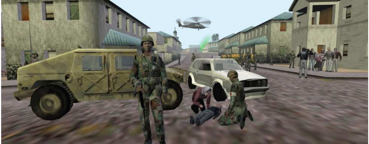
Figure 1: The MRE domain: Bosnian Group shown at right.

types of gestures to indicate speaking and other motions. Figure 2 shows a snapshot of the characters involved in conversation.