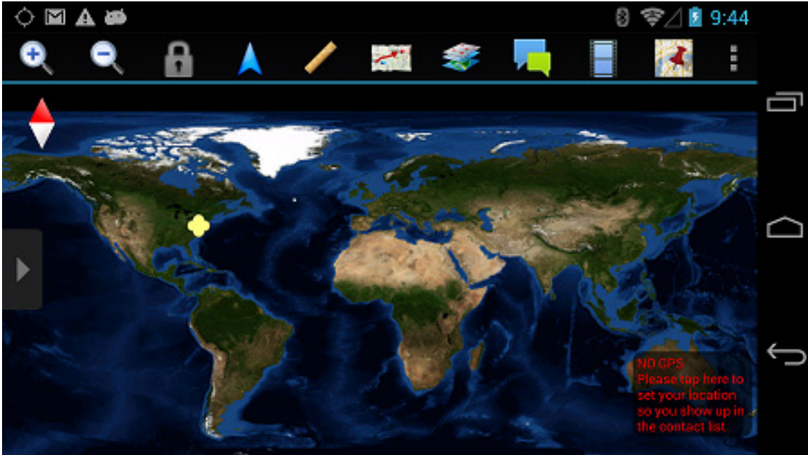
Fig. 1 Main screen

Figure 1 shows the main screen for ATAK. Basic Android touch screen motions provide various ways to select an area of the displayed map. These include zoom in and zoom out, and slide left, right, up, and down. By way of these touch screen motions, a bounding box of interest can be selected, as shown in Fig. 2.