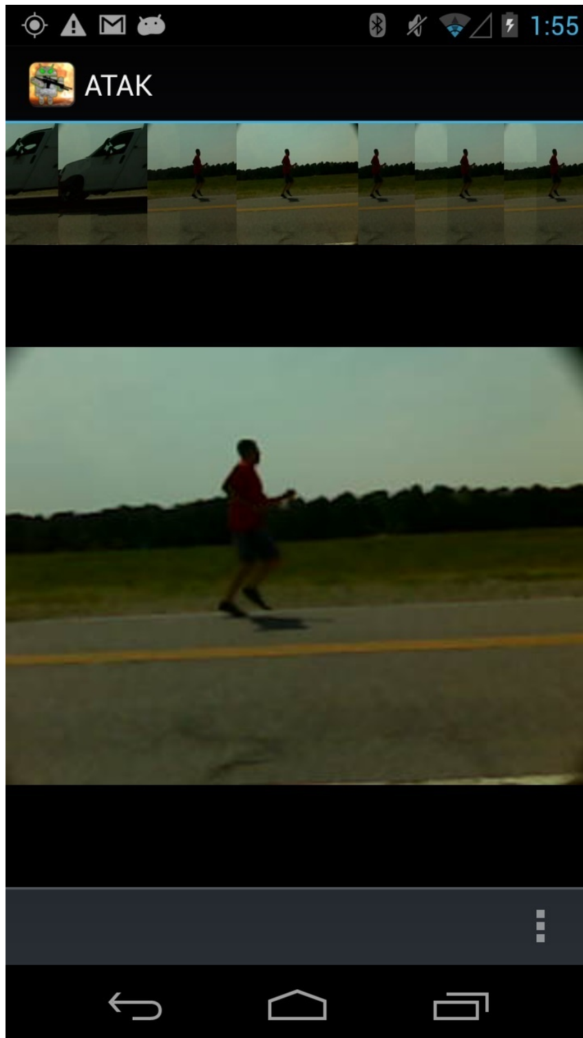
Fig. 4 Selected thumbnail image displayed using the ImageSwitcher

ImageAdapter provides access to the data items and makes a view for each item in the ArrayList . This is done by overriding the getView method, which returns an ImageView object with the user-selected image inside the ImageView .