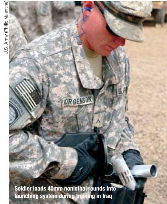
Soldier loads 40mm nonlethal rounds into launching system during training in Iraq

In 2004, the Council on Foreign Relations called for “incorporating . . . non-lethal capabilities more broadly into the equipment, training, and doctrine of the U.S. armed services,” concluding that doing so “could substantially improve the United States’ ability to achieve its goals across the full spectrum of modern war.” 35 In 2007, a RAND study highlighted the “inadequacy” of nonlethal capabilities and the negative political fallout from killing noncombatants. 36 In 2009, RAND called for a range of capabilities that are scalable for maximum effectiveness, concluding that “creating and mainstreaming this capability requires vision, initiative, commitment, and persistence on the part of those soldiers’ civilian and military leaders.” 37 And Brookings Institution scholar Michael O’Hanlon has argued, “Rather than ask our troops to make a choice between being at risk and taking actions that could kill innocent Afghans and set back the war effort, we should give them the [nonlethal] tools they need to do their job.” 38