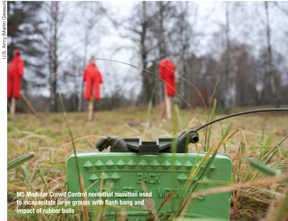
M5 Modular Crowd Control nonlethal munition used to incapacitate large groups with flash bang and impact of rubber balls