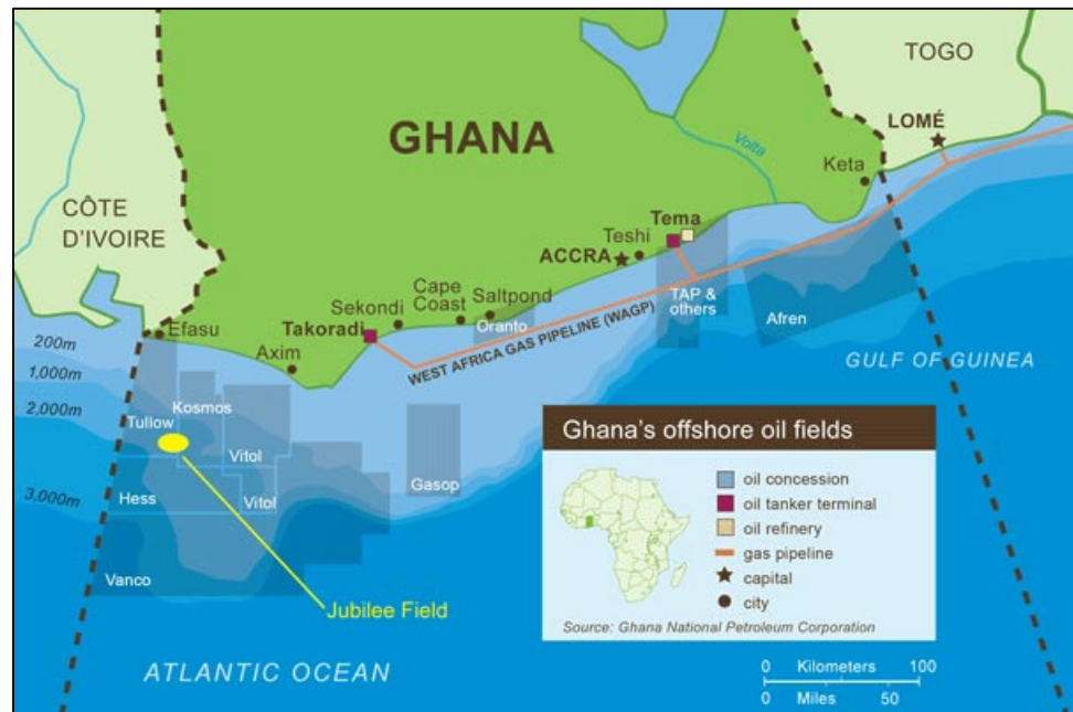
Figure 1. Ghana's offshore oil fields

runs from Lagos, Nigeria, to Takoradi, Ghana; the WAGP Extension, which runs from Takoradi to Abidjan, Côte d'Ivoire; a commercial port at Tema; and another commercial port under construction at Sekondi-Takoradi.