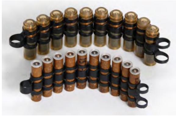
Figure 3. Cased (Top) and Caseless (Bottom) Telescoped Cartridges, Linked

The primary design difficulty of this type of round is ensuring that the propellant's explosive force can efficiently push the projectile down the barrel, without a loss of performance. Research indicates that Joint Service Small Arms Program has had some success in this design, as they feature it prominently in both cased and caseless variants of their LSAT program. 29