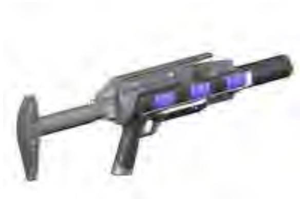
Figure 4. “Metal Storm” Grenade Launcher Concept Drawing, Showing a Three Round Magazine or Ammunition in Series

projectiles. It is this principle that was developed by, and is used in, the “Metal Storm” firearms technologies. The end result of this engineering is staggering rates of fire, up to one million rounds per minute. 30