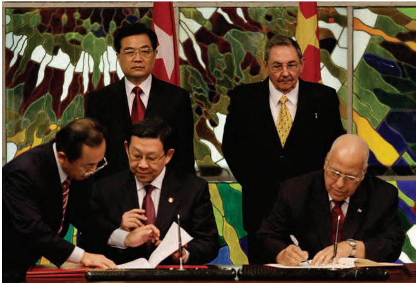
Chinese President Hu Jintao and Cuban President Raul Castro watch signing of treaties in Havana after Hu signed dozens of trade and investment deals with Cuba