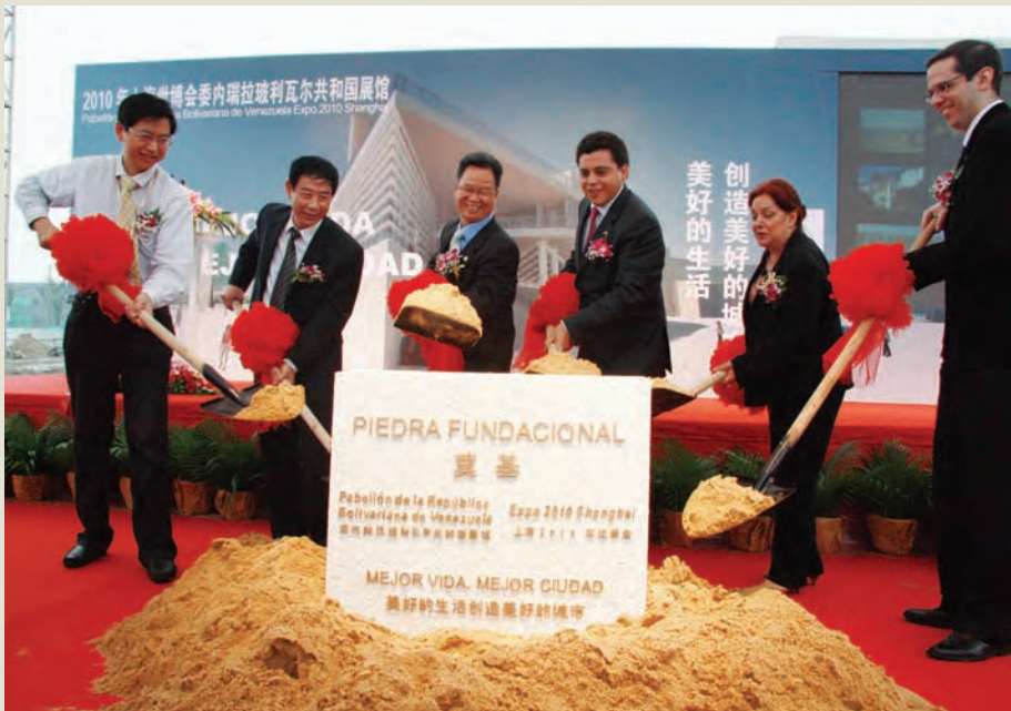
Venezuelan officials bury foundation stone at groundbreaking for Venezuela Pavilion at Shanghai World Expo 2010

Chinese companies in Latin America are often seen as poor corporate citizens, reserving the best jobs and subcontracts for their own nationals, treating workers harshly, and maintaining poor relations with the local community. In the arena of China–Latin America military exchanges, it is interesting to note that Latin American military officers participating in such programs are often jokingly stigmatized by their colleagues in ways that officers participating in exchange programs in the United States are not.