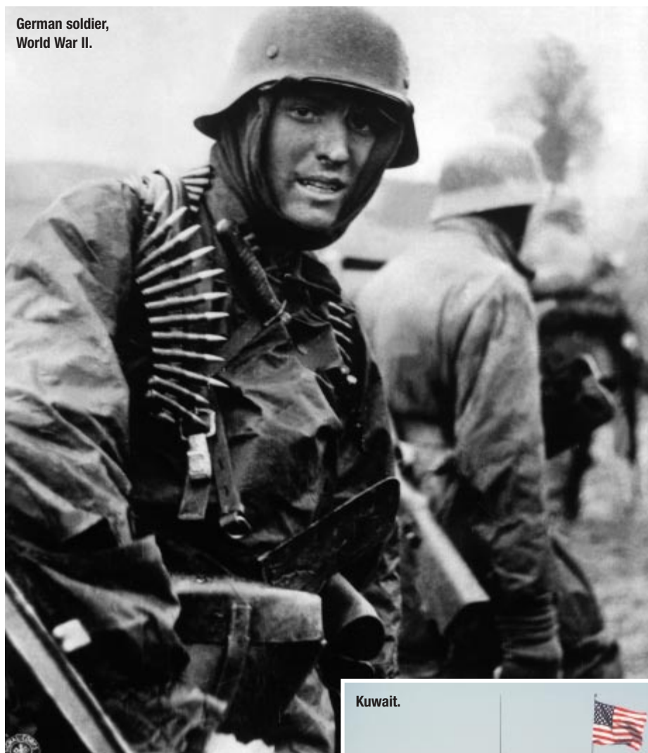
German soldier, World War II.