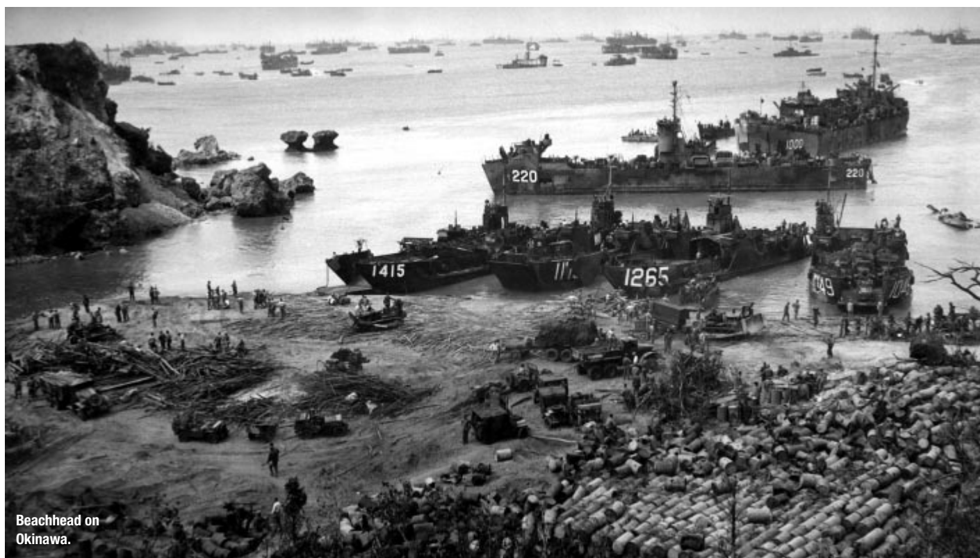
Beachhead on Okinawa.