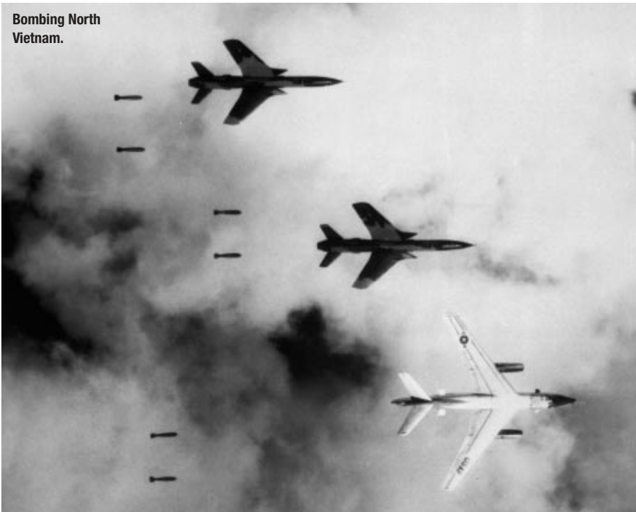
Bombing North Vietnam.