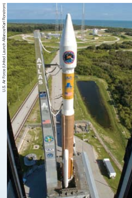
U.S. Air Force (United Launch Alliance/Karl Ronstrom)

Capitalizing on the Desert Storm experience, the Air Force focused its efforts on enabling warfighters to leverage space capabilities by creating the Space Warfare Center in 1993. 2 This led to the rapid exploitation of space capabilities such as GPS, satellite communications, and national space systems to enhance joint warfighting tasks. Space capabilities allowed quicker recovery of downed pilots, fostered the development of extremely precise GPS-aided munitions, and enabled a Global Broadcast Service to pump previously unimagined amounts of data to and from theater warfighters. Air operations in the Balkans would later validate that GPS could dramatically enhance the precision and lethality of weapons systems—effectively revolutionizing the American way of war.