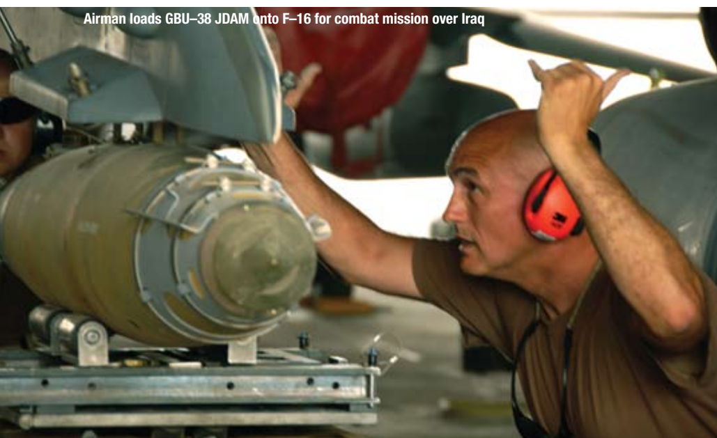
Airman loads GBU-38 JDAM onto F-16 for combat mission over Iraq

GPS features add fidelity to aircrew survival and personnel recovery radios, essentially taking the search out of search and rescue