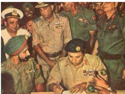
Commander of Pakistan Army in the East signs Instrument of Surrender ending Indo-Pakistan Liberation War, 1971

In 1978, the Carter administration, probably unintentionally, undertook a two-track approach to the future of Iran. William Sullivan, a career Foreign Service officer and by then the U.S. Ambassador to Iran, was the voice of the State Department. He and his backers saw Iran's future in the hands of the clerics. He wished to meet and negotiate with Khomeini, whom he envisioned as a Gandhi-like figure whose accession to power would reflect the values and serve the interests of the United States. At the same time both Carter's national security advisor, Zbigniew Brzezinski, and the Pentagon wanted to rely on the Shah's well-trained military to maintain order. The Brzezinski components of the Carter administration hoped the Iranian armed forces would hold together in order to run the country when and if the Shah left. They saw radical Islam as a serious threat to the West. As 1979 dawned, Ambassador Sullivan was already in Iran conversing with the clerics, while President Carter still thought