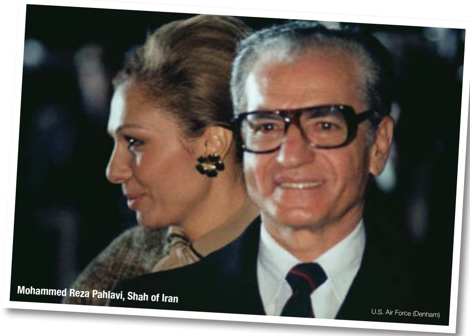
Mohammed Reza Pahlavi, Shah of Iran