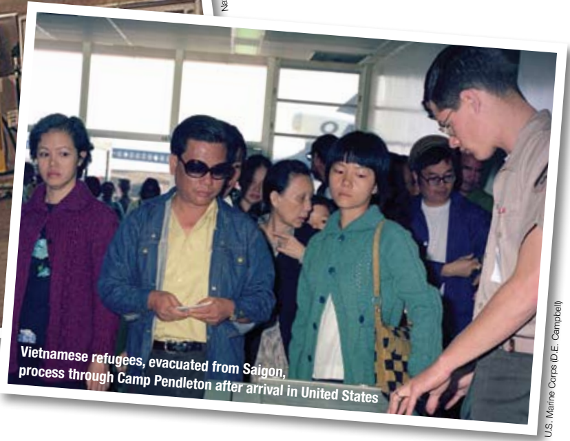
U.S. Marine Corps (D.E. Campbell)