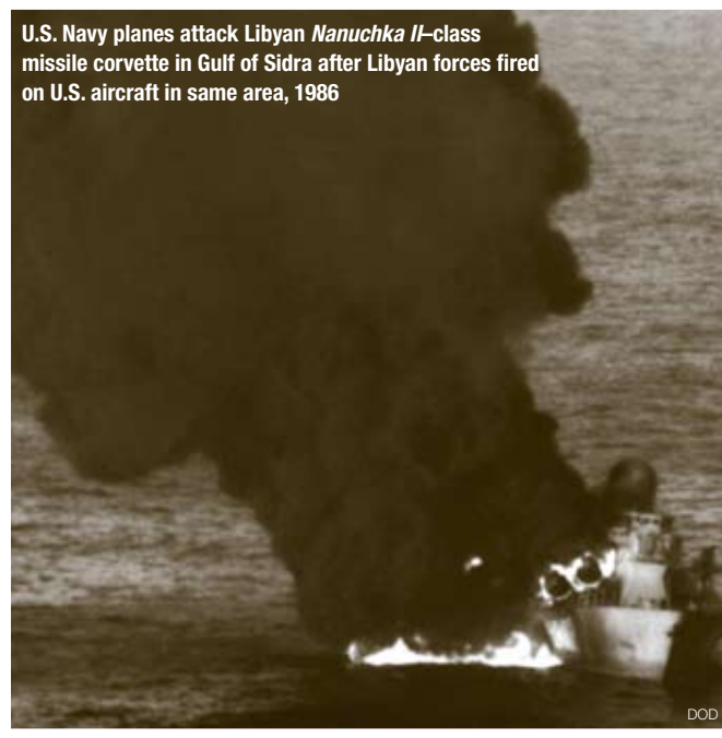
U.S. Navy planes attack Libyan Nanuchka II -class missile corvette in Gulf of Sidra after Libyan forces fired on U.S. aircraft in same area, 1986

With a war of independence in the air, the Cold War superpowers promptly took sides. On August 9, India and the Soviet Union executed a 20-year Treaty of Friendship and Cooperation. As an offset, during that same summer, the Chinese offered material, but not military, support to Pakistan. The Nixon administration, with one eye on its planned rapprochement with China, joined