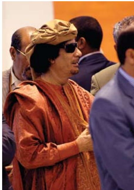
Colonel Muammar Abu Minyar al-Qadhafi

On September 1, 1969, the 27-year-old Captain Qadhafi and a handful of his fellow officers made their move. Armed with a few