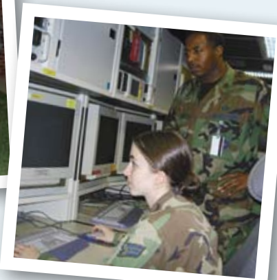
Right: Airmen analyze data at imagery workstation within Distributed Common Ground System