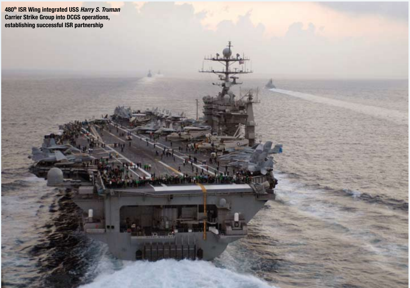
480 th ISR Wing integrated USS Harry S. Truman Carrier Strike Group into DCGS operations, establishing successful ISR partnership