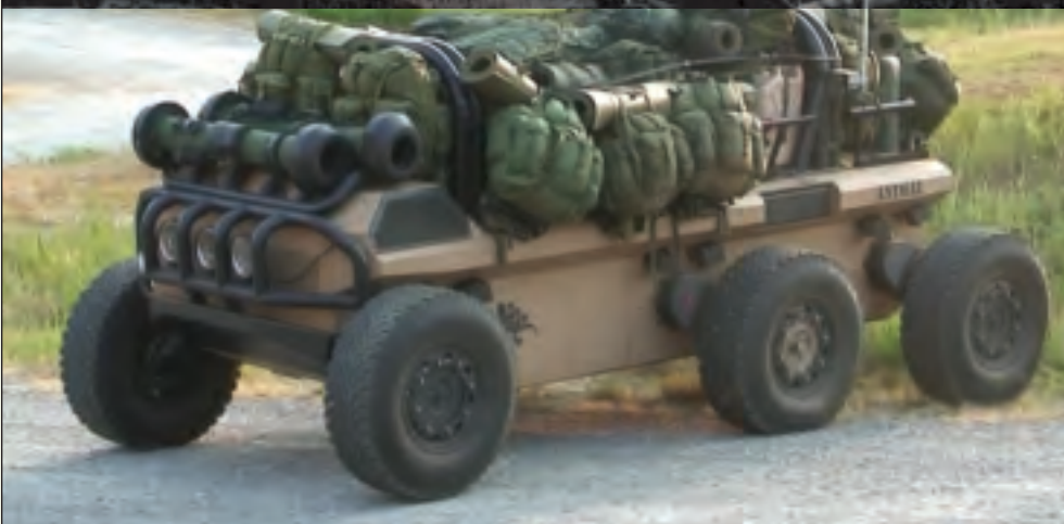
The MULE EEU, configured as a MULE-T, is undergoing capability testing at Camp Gruber, OK. The MULE-T can carry two squads' worth of weapons, ammo and equipment.

MULE-T is designed to be the Soldiers' "pickup truck." With a payload of more than 1,900 pounds, the MULE-T will take loads off Soldiers' backs. Designed to carry more than two squads' worth of equipment, it provides commanders a flexible platform to move supplies and equipment throughout the operational environment, freeing Soldiers to focus on combat tasks. This ability to form robotic convoys will further take Soldiers out of harm's way by letting these robust robots carry loads instead of placing drivers on the road. The capability of a medium robot to autonomously navigate on the modern battlefield frees Soldiers from having to "teleoperate" it as we do robots today. By integrating ANS onto the MULE, the robot is now able to