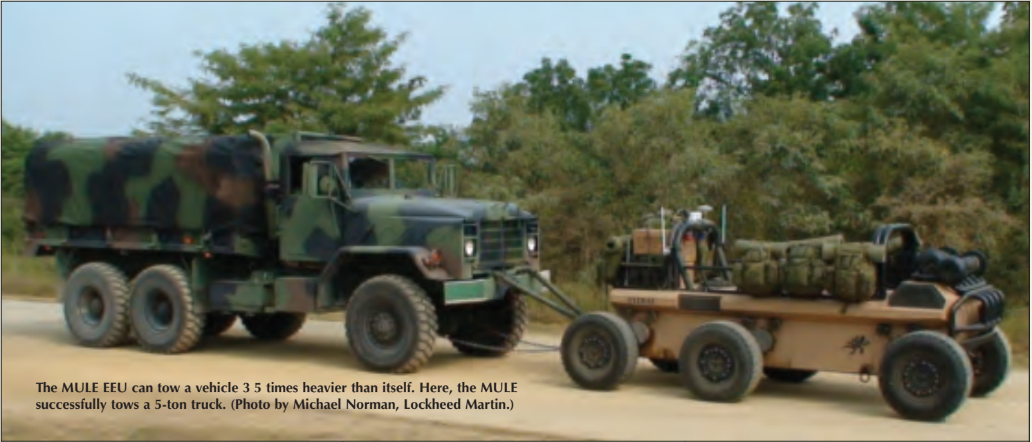
The MULE EEU can tow a vehicle 3.5 times heavier than itself. Here, the MULE successfully tows a 5-ton truck.

The MULE is the multifunctional vehicle developed by Lockheed Martin Missiles and Fire Control (LM MFC) as part of the Army's Future Combat Systems (FCS) program. The MULE is a family of unmanned ground vehicles (UGVs) that will be in the 7,000 pound class of medium robots. Within 20 years, the MULE will be commonplace in every brigade in the Army. What makes these systems unique is the mobility, processing power, networked connectivity and robot size. The MULE family consists of three robotic vehicles: the MULE Transport (MULE-T), the MULE Countermine (MULE-C) and the Armed Robotic Vehicle-Assault (Light) (ARV-A(L)).