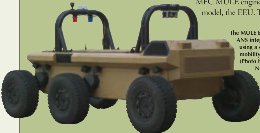
The MULE EEU conducts ANS integration testing using a common mobility platform.

This means that early in the product development cycle we understand what data is available and how it is tied to vehicle performance. This allows the Army to better project when parts will fail, further reducing Soldier sustainment burdens due to a greatly reduced logistics train. It also will result in a lower life-cycle cost for spares for the MULE in the future.