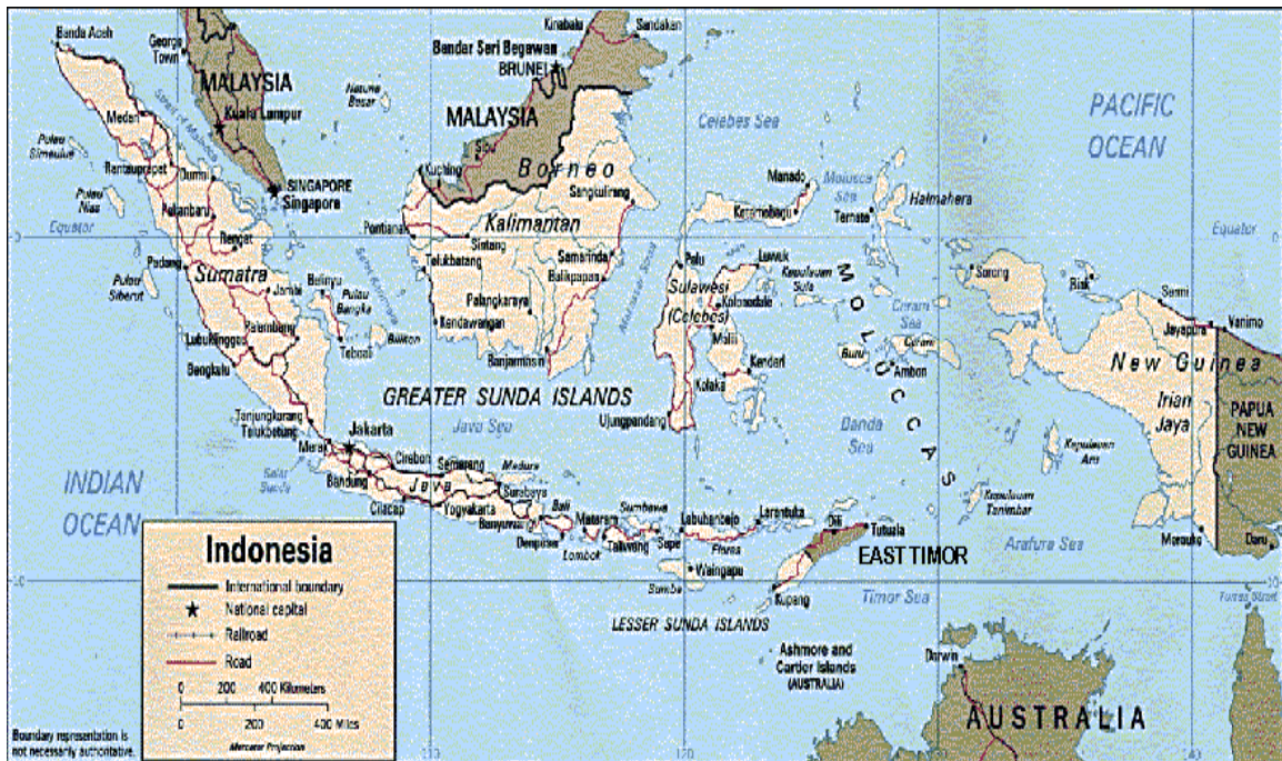
Figure 1: Map of Indonesia