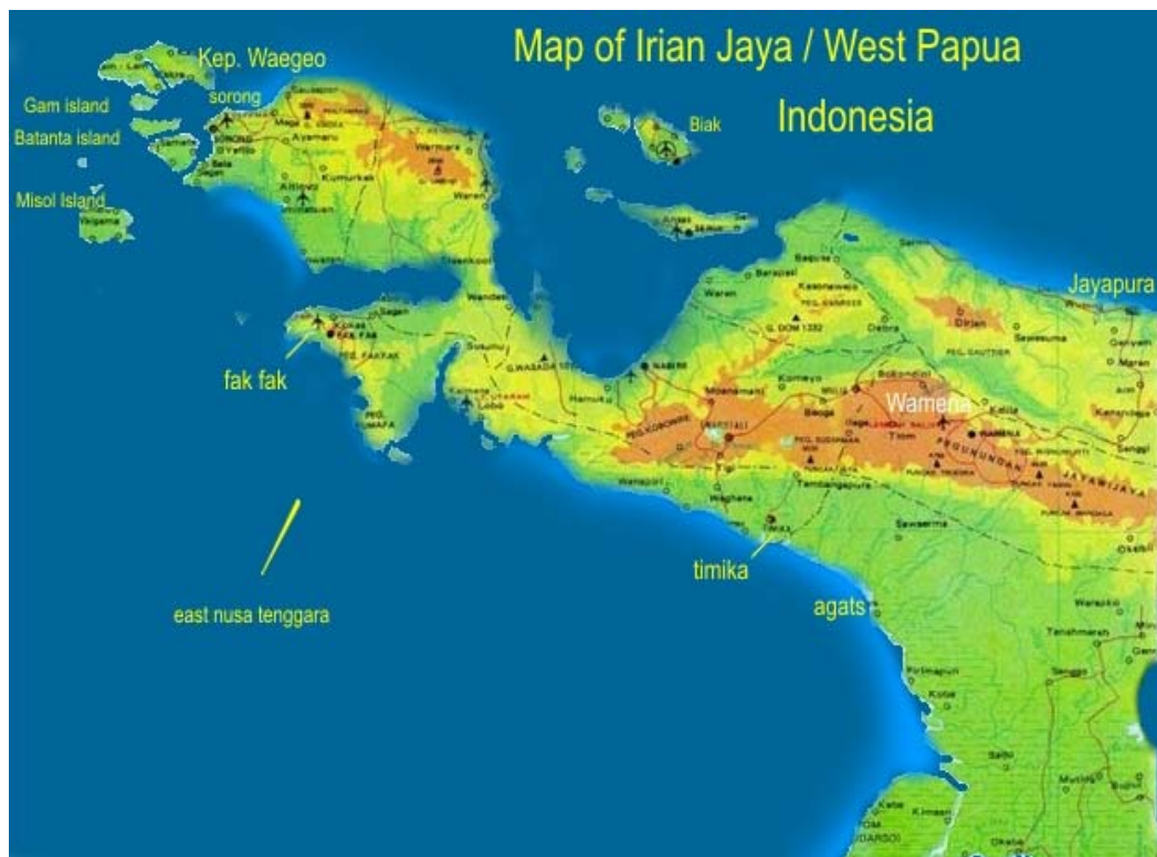
Figure 2: Map of West Papua

(President Sukarno, Jogjakarta, 19 December 1961) 10