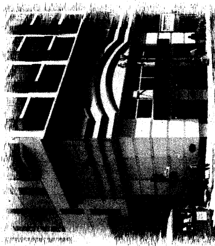
Crowne Plaza Union Square

Shuttle services are available at the airport at a rate of approximately $12 one way. Parking at the hotel is $29/day. Restaurants, shopping, and other attractions can be reached by walking or taking the trolley.